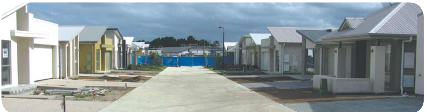
Progress to date on the new Awards Collection homes

50plus are about to commence construction on the next stage of 13 homes at Halcyon Waters and are currently running a charity onsite at Hope Island with a target to raise $10,000 for Camp Quality.