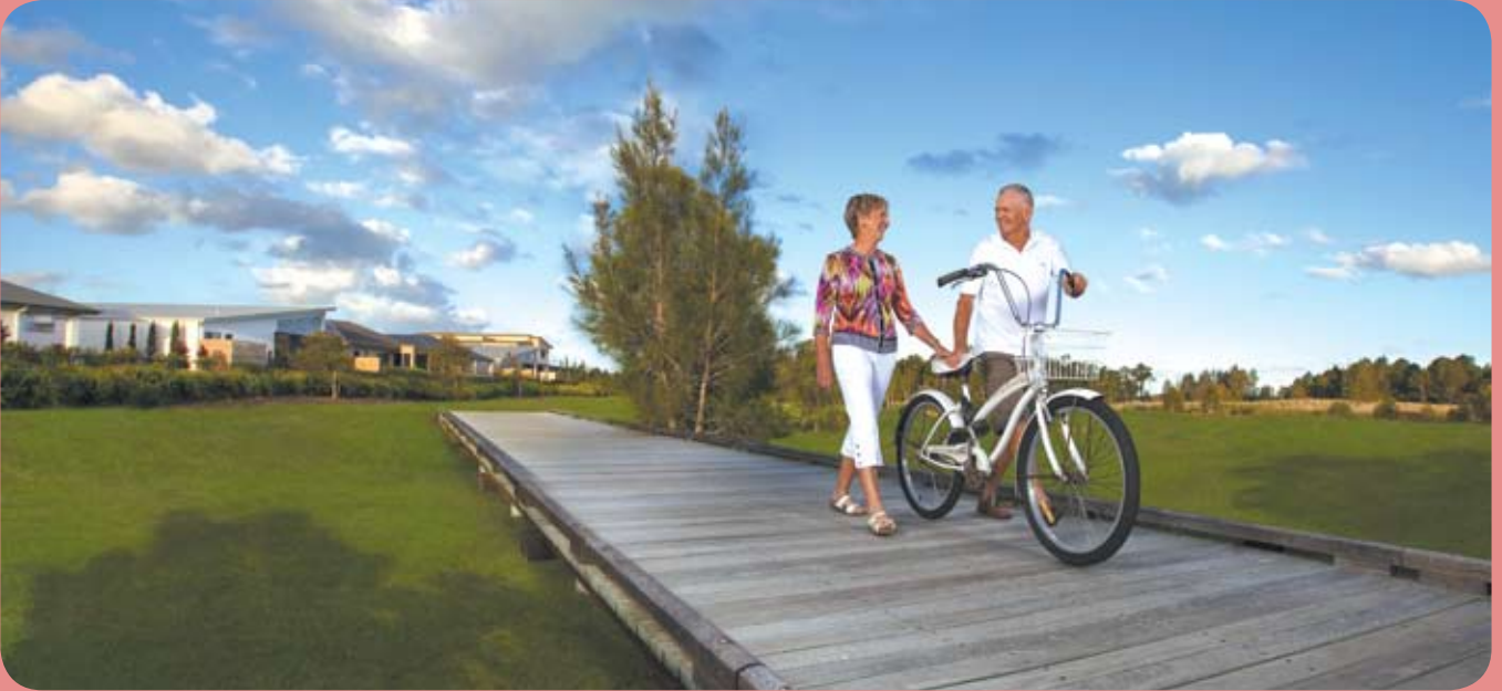
Celebration Park at Halcyon Waters