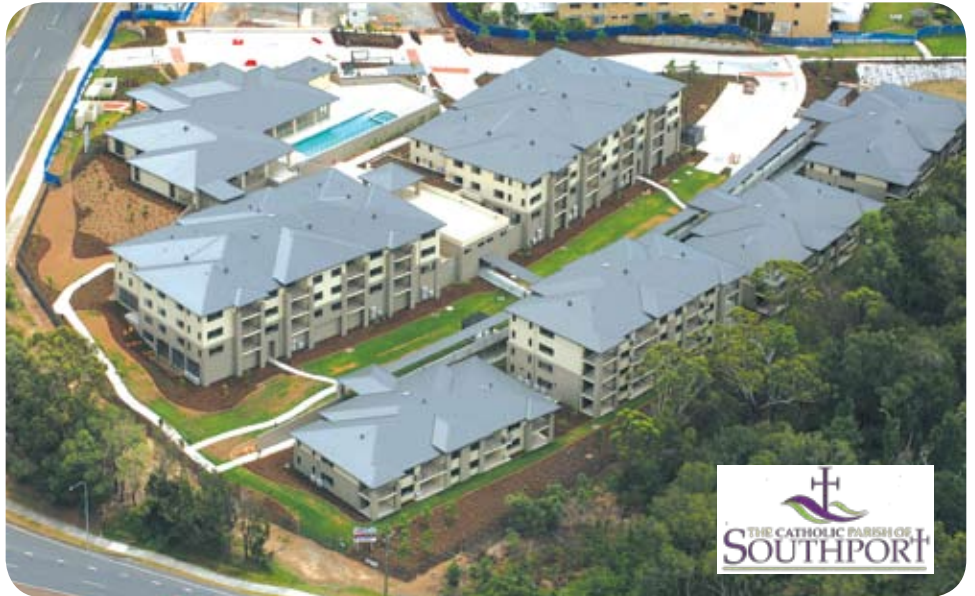
An aerial view of the recently completed DePaul Manor Estate

50plus puts the finishing touches to the next 23 homes at the award winning lifestyle community.