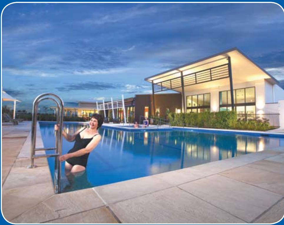
Halcyon Waters' lavish Leisure Club