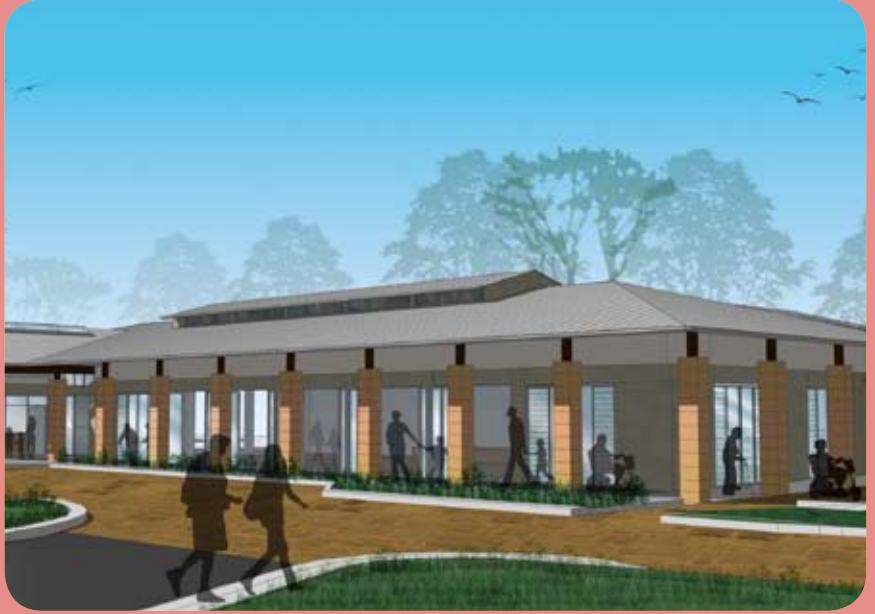
An artist's impression of the Community Centre when complete

Total building area is 1300m 2 and is due for completion in August, 2010.