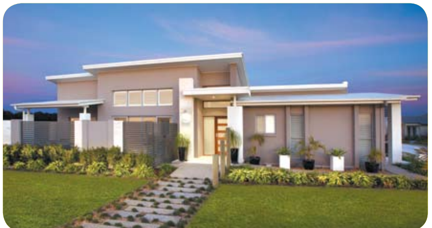
One of the award winning homes at Halcyon Waters