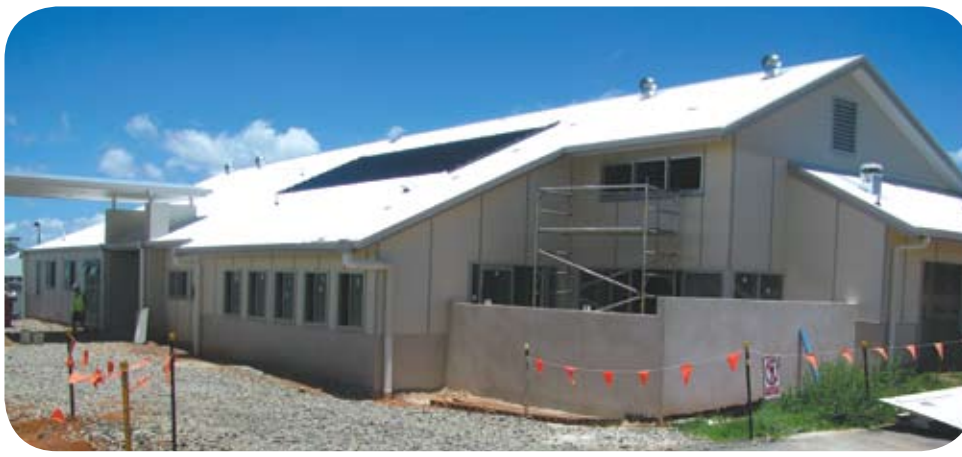
Community Wellness Centre takes shape